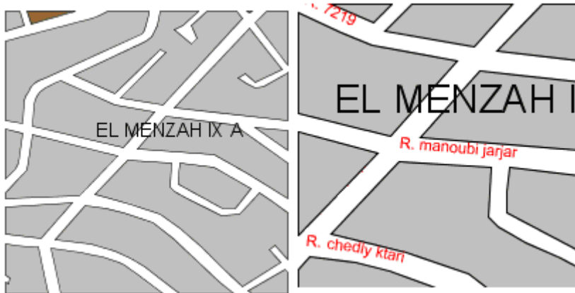
Figure 1: Reducing encumbering details when a zoom out is applied by filtering the layer representing the streets.